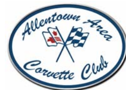
▲ Approx. size

Indicate how many pins you want on the interest sheet at a meeting. Monies will be collected before the order is placed. More information will be given during upcoming meetings.